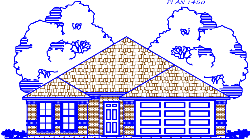
A FRONT ELEVATION