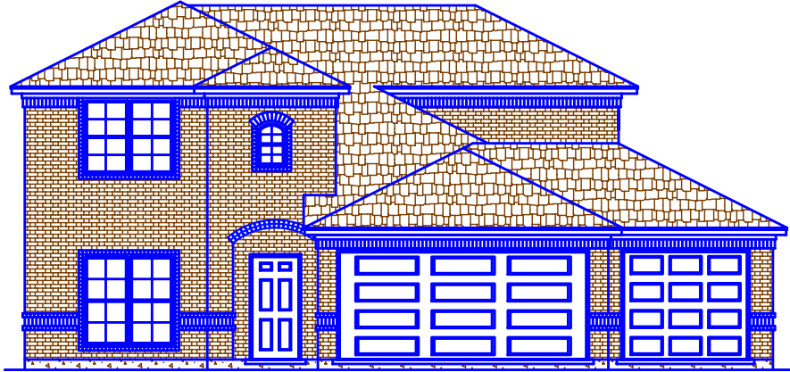
A FRONT ELEVATION