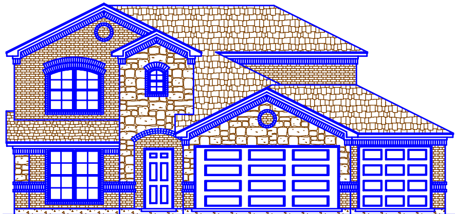
C FRONT ELEVATION