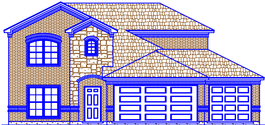
B FRONT ELEVATION