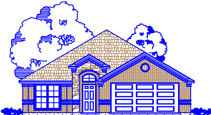
C FRONT ELEVATION SCALE: 1/4" = 1'-0"