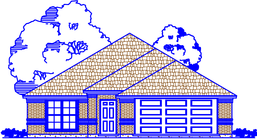
A FRONT ELEVATION SCALE: 1/4" = 1'-0"