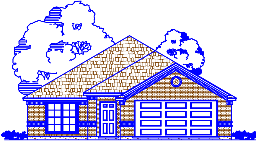
B FRONT ELEVATION SCALE: 1/4" = 1'-0"