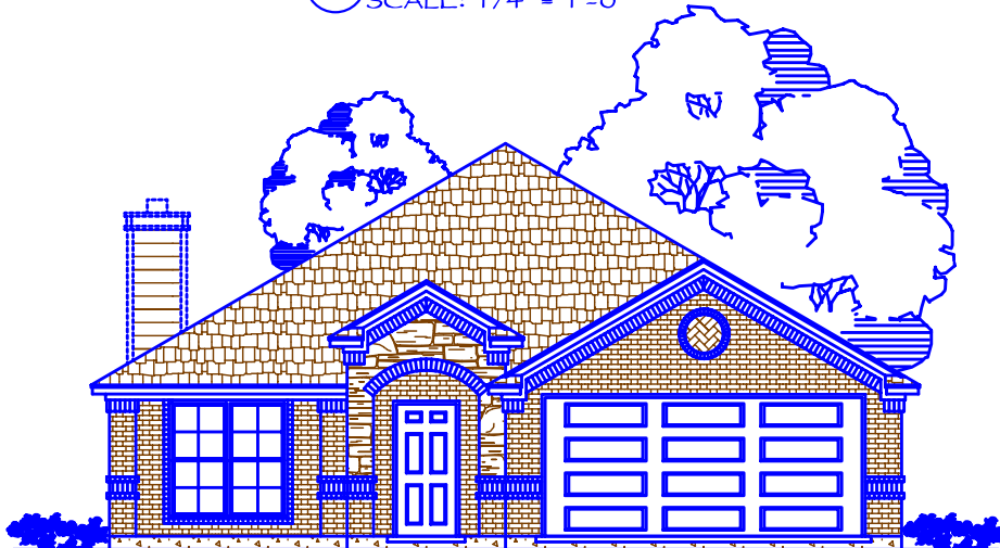
C FRONT ELEVATION SCALE: 1/4" = 1'-0"