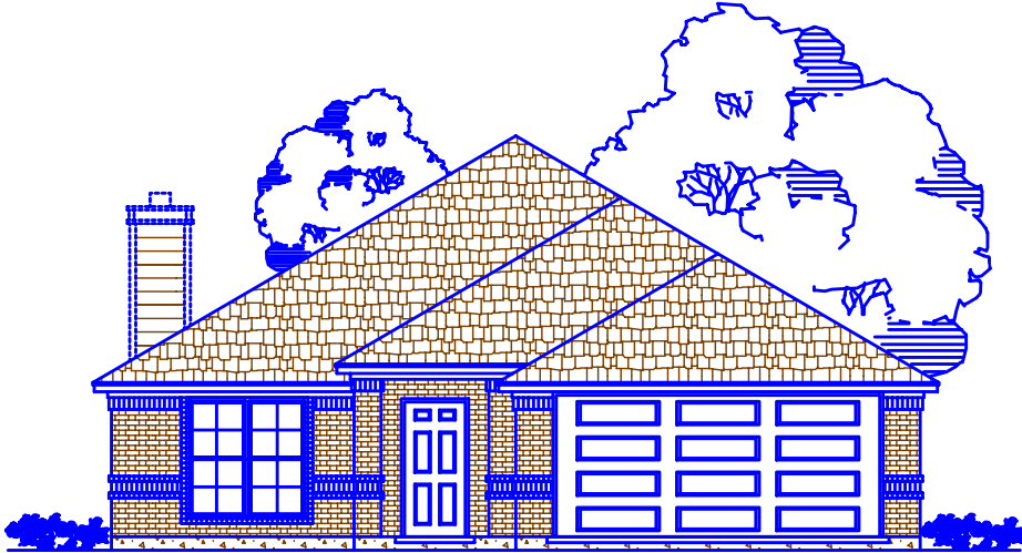
A FRONT ELEVATION SCALE: 1/4" = 1'-0"