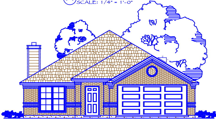
B FRONT ELEVATION SCALE: 1/4" = 1'-0"