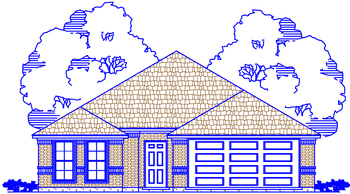
A FRONT ELEVATION