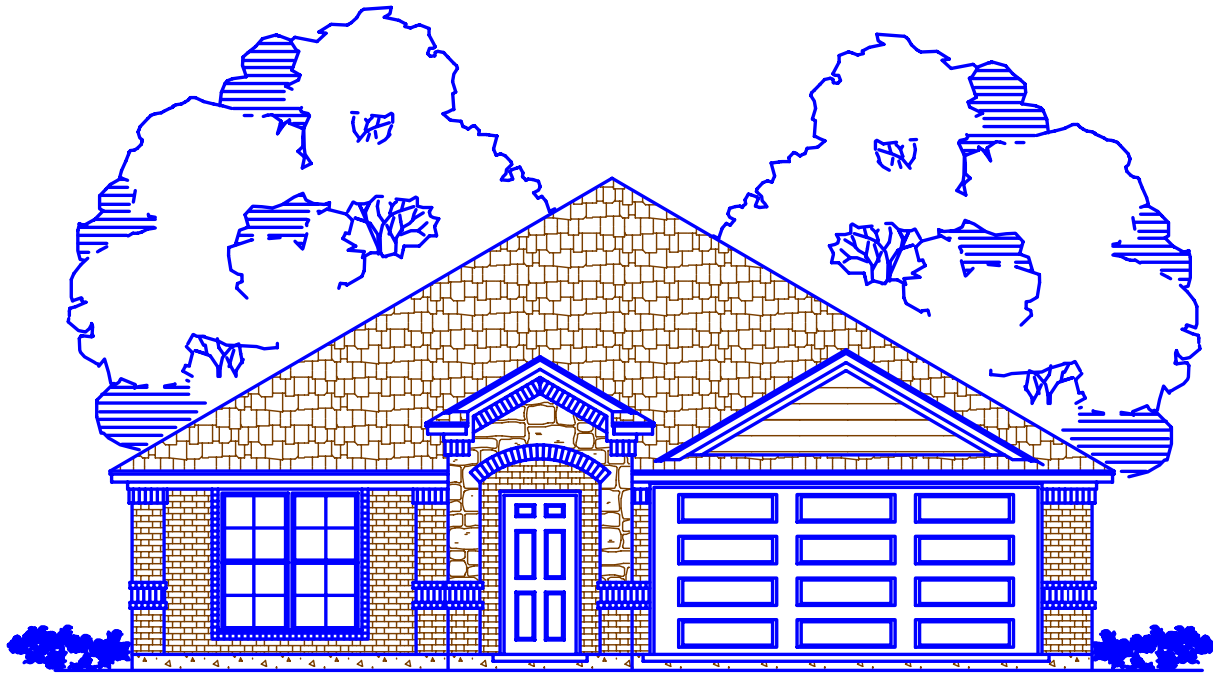
C FRONT ELEVATION